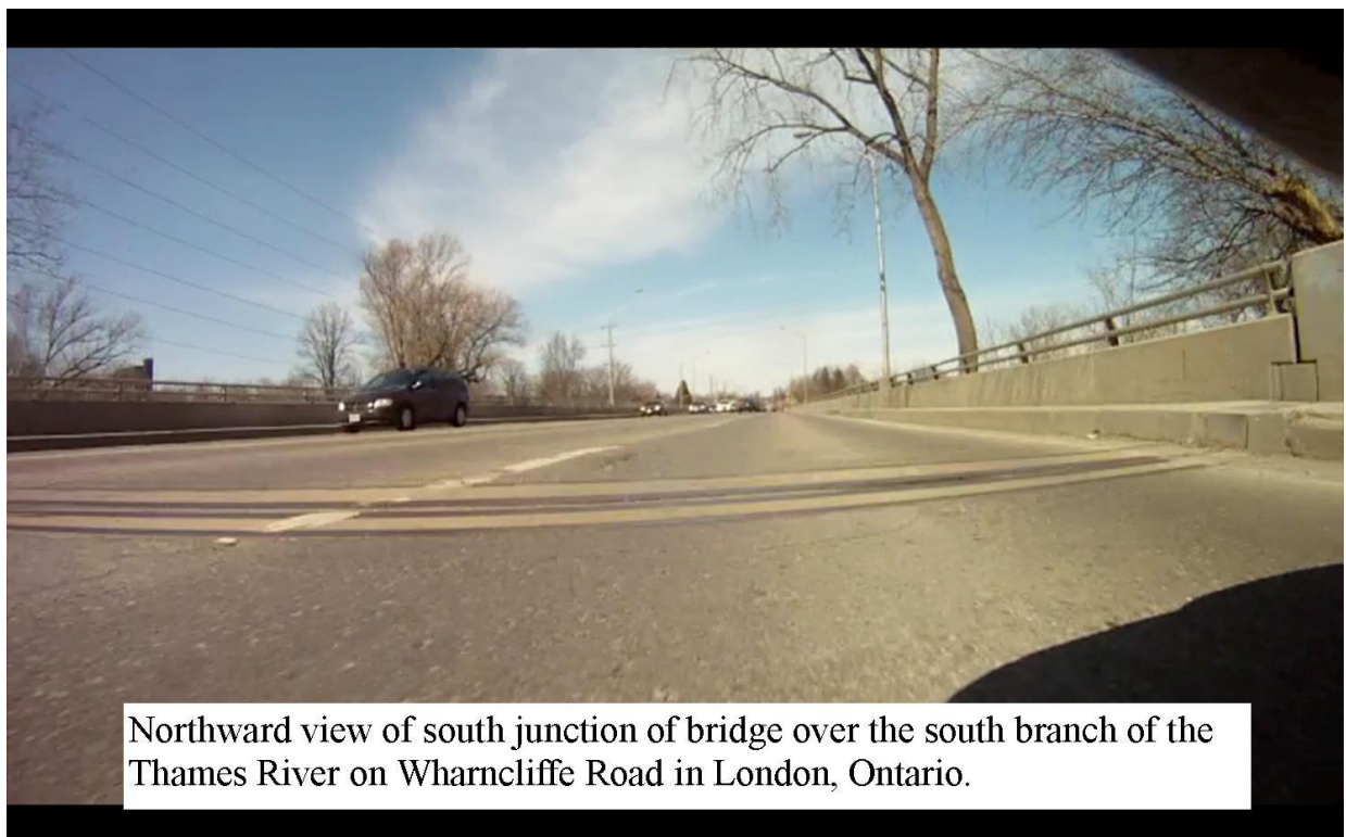
Northward view of south junction of bridge over the south branch of the Thames River on Wharncliffe Road in London, Ontario.

In the present article we focus on a special character of a road that exists regardless of where one might travel. Bridge junctions and railway tracks are discontinuities in the normally smooth road surface that could be an influence in the cause of a loss-of-control collisions. In normal circumstances the bumps that are felt when passing over these features are often nothing more than a nuisance. However in special circumstances, such as icy or snow-covered road surfaces, or even in wet surface conditions the large tire force that is normally available on dry road surfaces becomes reduced and thus those disturbances experienced when passing over bridge junctions and railway tracks may be sufficient to cause a vehicle loss-of-control.